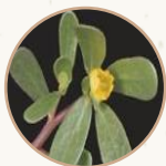
Common purslane (ohangcho)

Power of natural yeast Haenaroo fermented liquid that purifies the body and raise immunity!!!