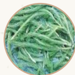
Pine tree bud